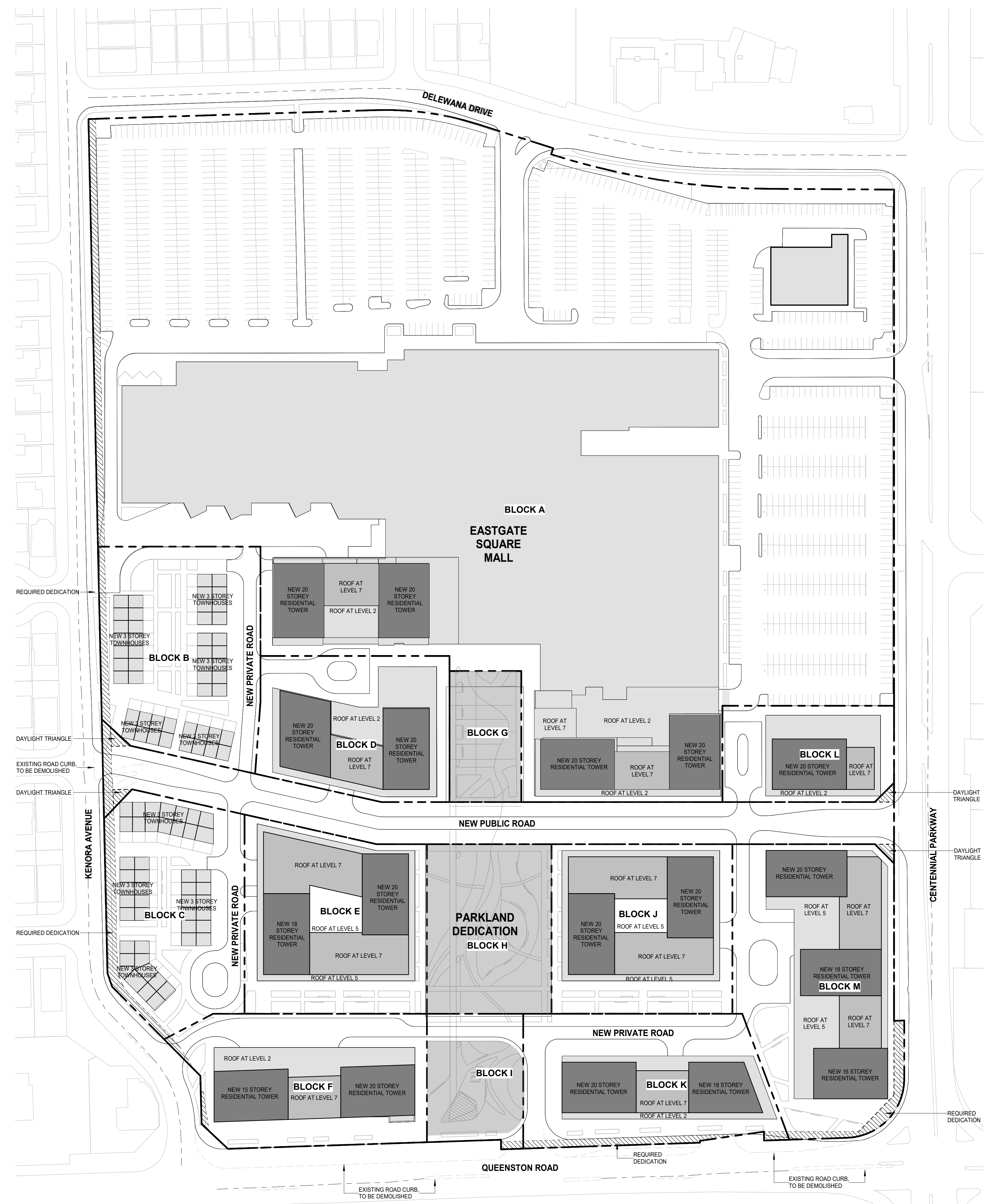
1 SITE PLAN A101.S